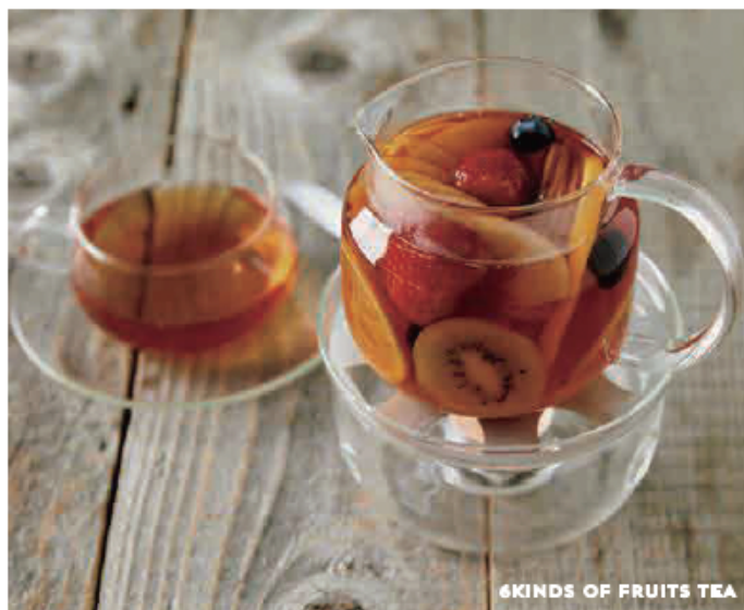
6KINDS OF FRUITS TEA