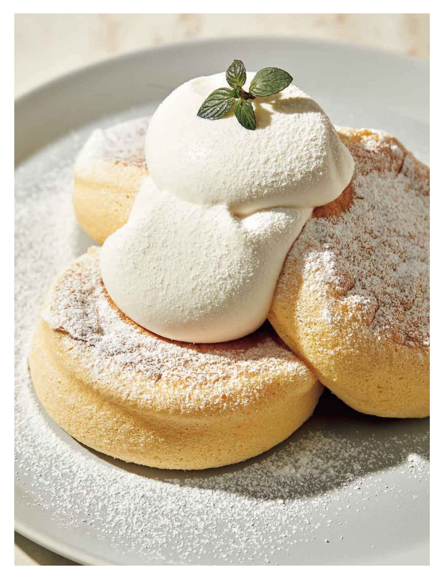
EGG FARM TO TABLE

A BRUNCH CAFE THAT MATCHES THE LIFESTYLES OF PEOPLE FROM ALL WALKS OF LIFE. FRESHLY PICKED EGGS, OUR FRESH AND DELICIOUS EGG DISHES ARE KIND TO BOTH BODY AND SOUL.