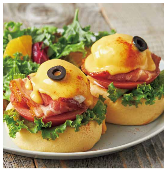
EGG BENEDICT B.L.T.

DAILY WHEAT EGGS SOY CHICKEN APPLES ORANGES 1,600 (1,760)