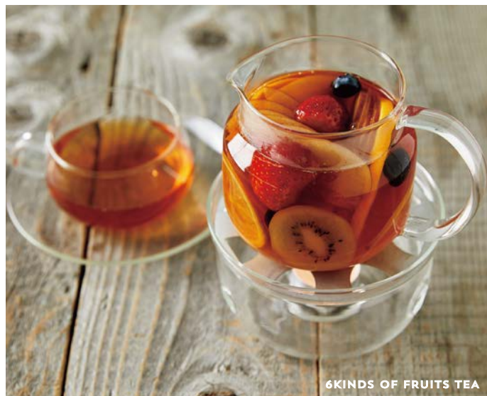
6KINDS OF FRUITS TEA

MATCHA AU LAIT (H/I) 750(825) 28 SPECIFIED ALLERGENS DAIRY